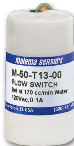
M-50 in PTFE